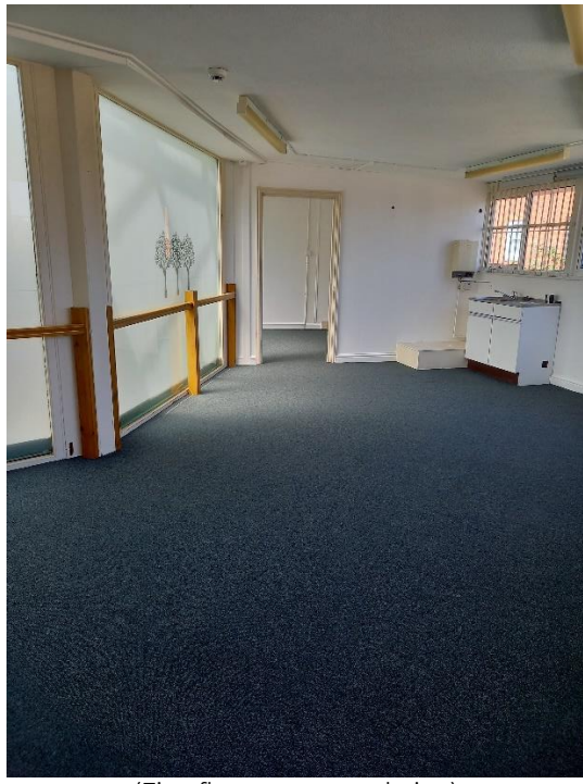
(First floor accommodation)